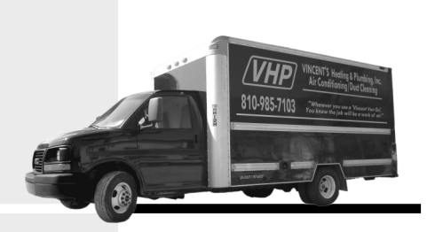
"Wherever you see a Vincent's Van Go' you know the job will be a work of art."